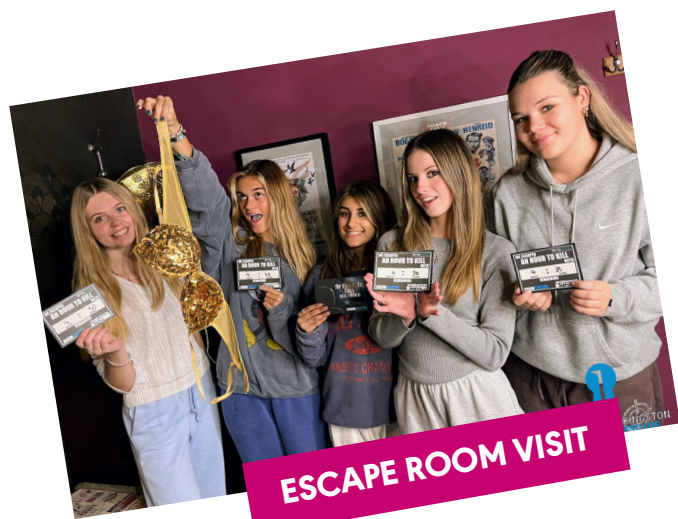
ESCAPE ROOM VISIT