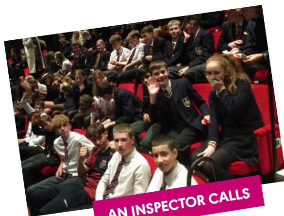
AN INSPECTOR CALLS