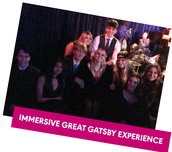
IMMERSIVE GREAT GATSBY EXPERIENCE